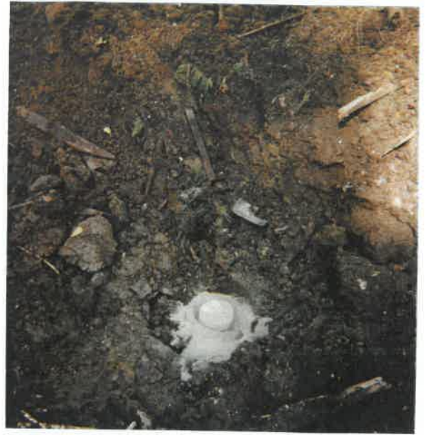
225 Garden St