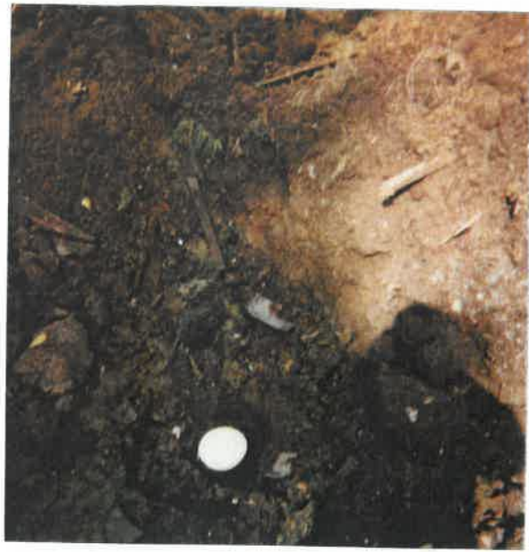
225 Garden St